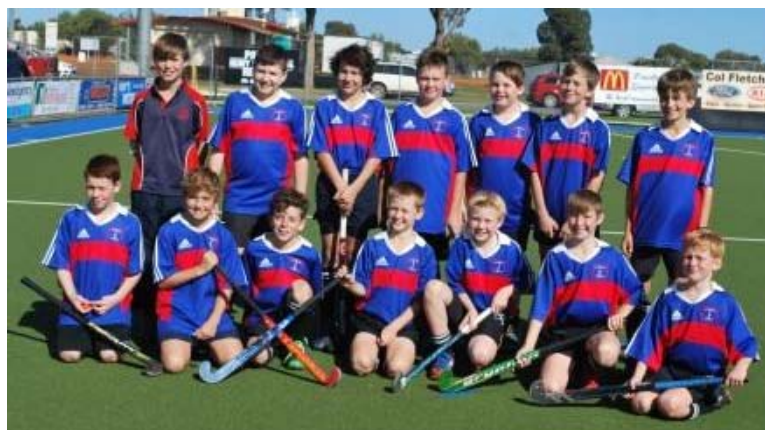
2016 Parkes Public School Boys' Hockey Team

Congratulations to our boys' hockey team who beat Calare Public School in the PSSA competition last week! They now go on to the state finals in September!!