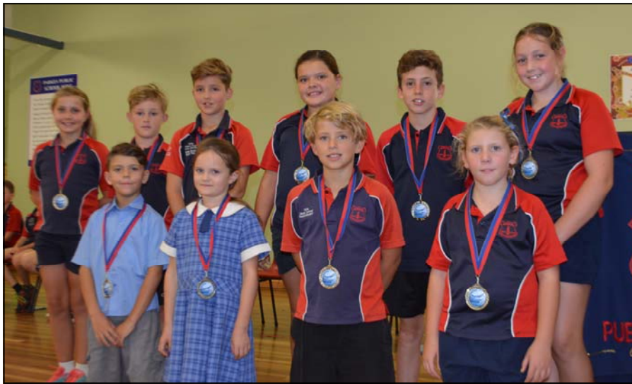
2017 Age Champions.