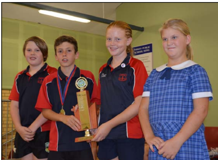
The 2017 Champion House was Wentworth!