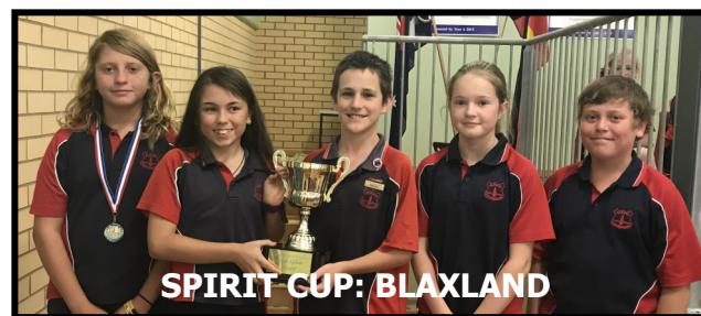
SPIRIT CUP: BLAXLAND