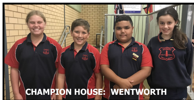
CHAMPION HOUSE: WENTWORTH