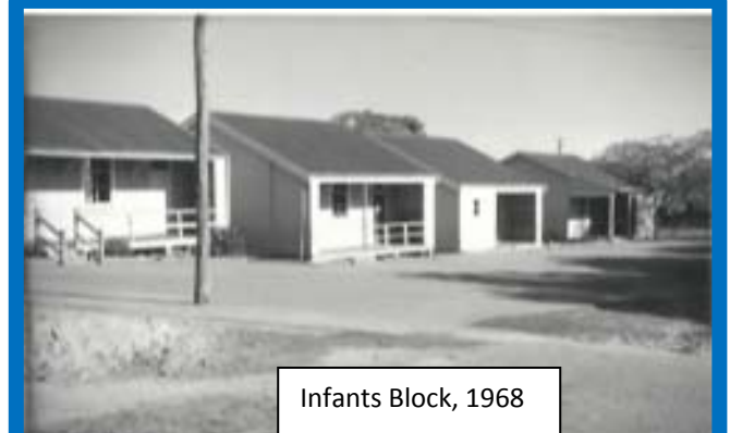
Infants Block, 1968