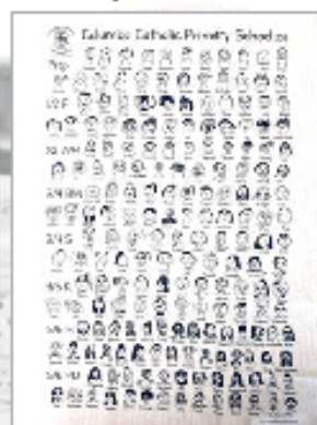
Example tea towel

Complete and return ONE form PER FAMILY: