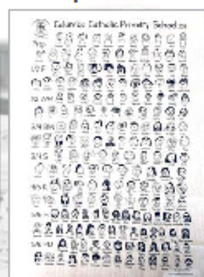
Example tea towel

Complete and return ONE form PER FAMILY: